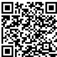
PASTORAL CARE REQUEST

TOCCATA ON "GREAT DAY" | ADOLPHUS HAILSTORK