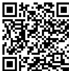
SPRC CONTACT FORM